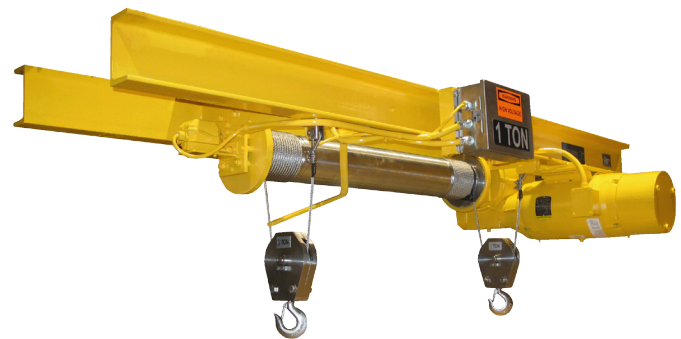
1-TON TWIN HOOK BASE MOUNTED HOIST WITH STAINLESS STEEL DRUMS, HOOK BLOCKS AND CABLE