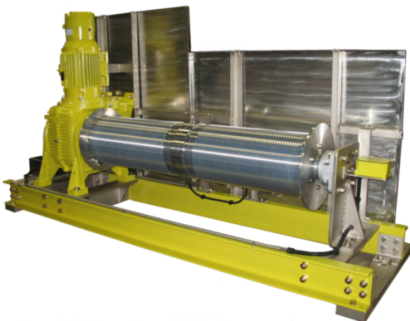
7.5-TON BASE MOUNTED WINCH WITH EPOXY/NICKEL PLATED FRAMEWORK STAINLESS STEEL DRUM & DRIP PANS