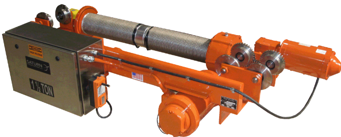
1.5-TON LOW HEADROOM HOIST WITH STAINLESS STEEL WHEELS & CONTROL ENCLOSURE