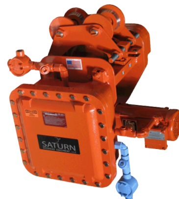
EXPLOSION PROOF DRIVE TRACTOR