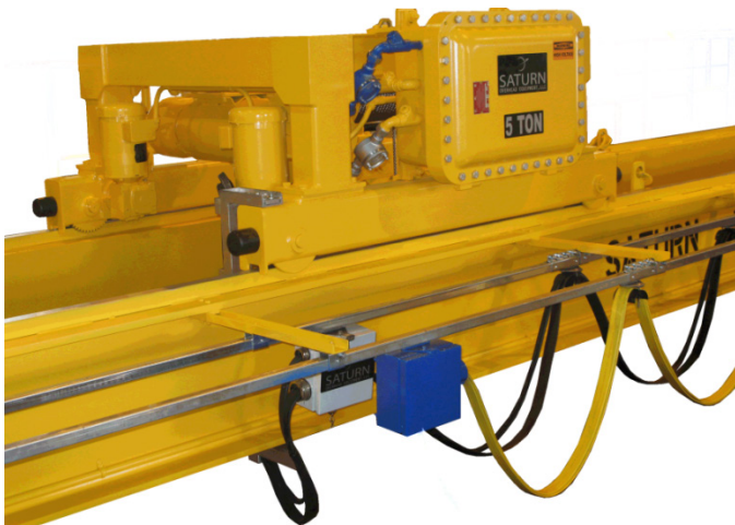
EXPLOSION PROOF CRANE SYSTEM