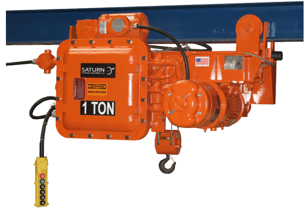
EXPLOSION PROOF HOIST WITH INTRINSICALLY SAFE PENDANT