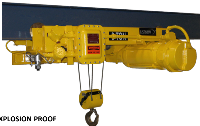
EXPLOSION PROOF LOW HEADROOM HOIST